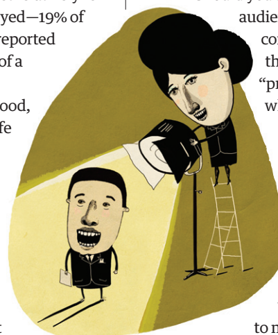
A good sponsor will coach you on your performance and train a spotlight on you so that everyone takes note of your abilities and potential.

What exactly does a sponsor do? According to our research, it boils down to two things: putting one's reputation on the line for a protégé and taking responsibility for his or her promotion. A good sponsor will groom you to audition for a key part in a prominent production, nudge the director to choose you, and coach you on your performance. While you're onstage, she'll train a spotlight on you so that everyone takes note of your abilities and potential.